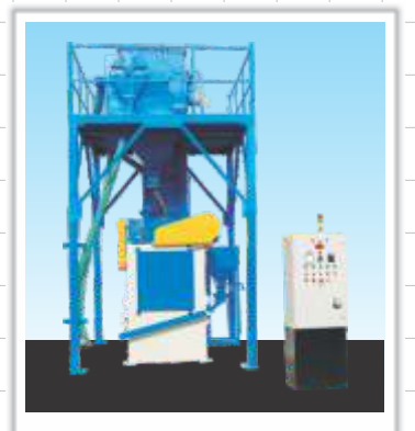
ATB - 16"x 22"

Magna Valve & Shot Classifier are suggestible for Shot Peening purpose.