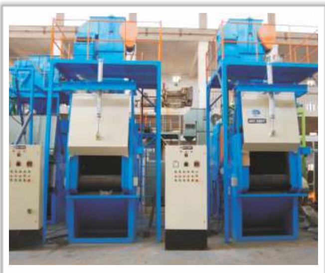
ATB 27" x 36" with Pneumatic Control Door