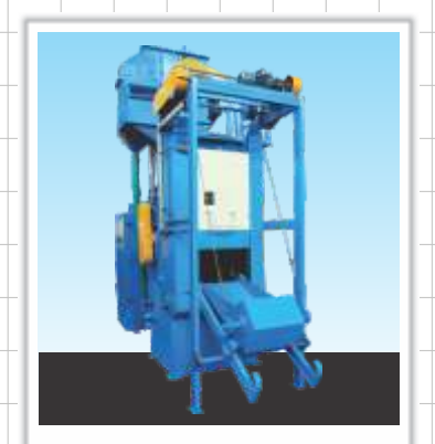
ATB - 20"x 27" with Loader